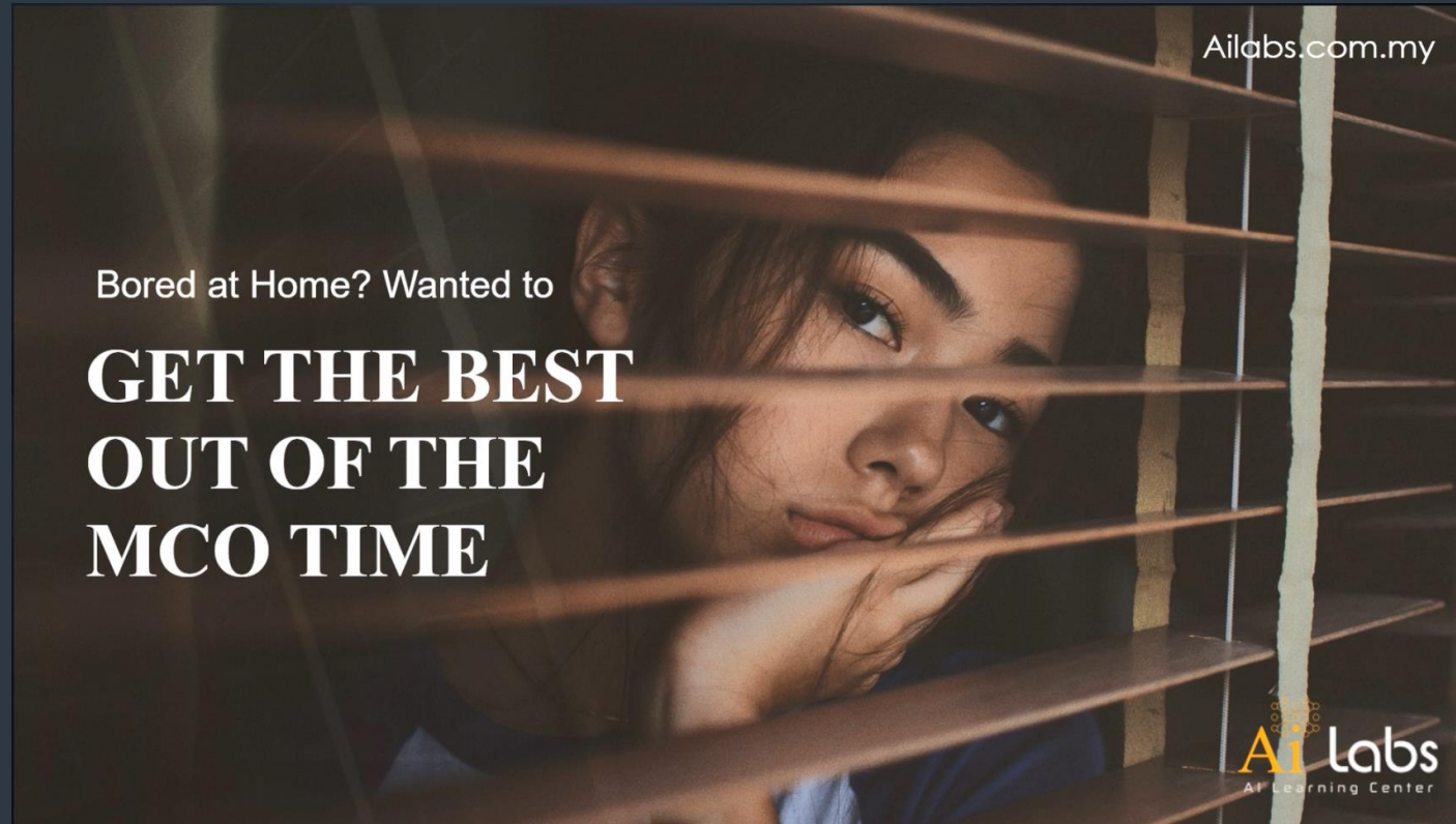
AI Labs 15 Sec Promotional Video